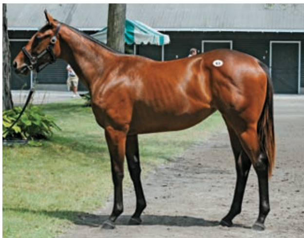
Bernardini—Sugar Shake is the top-priced filly at $950,000

recession, foreign economic woes, and problems within the racing industry were depressing prices at other Thoroughbred auctions in 2009, the Saratoga sale thrived. The gross was up 45.6% while the average and median increased 11.1% and 9.9%, respectively.