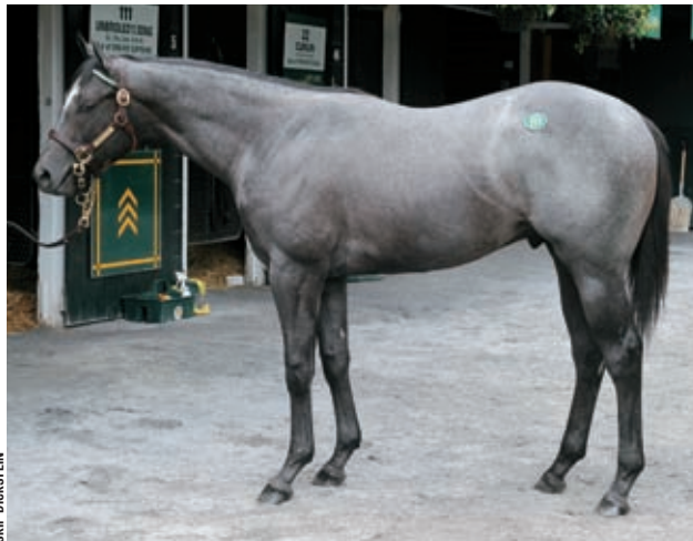
Colt by Unbridled's Song brings $775,000

champion Rhythm and grade I winners Bluegrass Cat and Girolamo. Darley Stable and then Godolphin Racing campaigned Girolamo (by A.P. Indy).