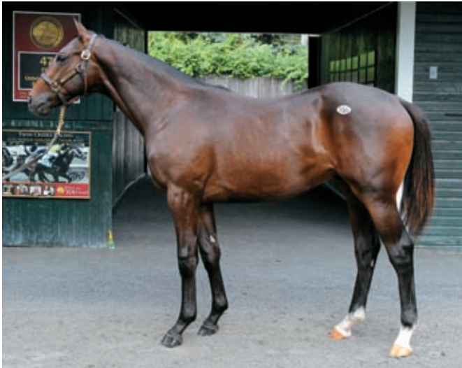
Superfection, a half brother to Super Saver, brings $1.2 million ...