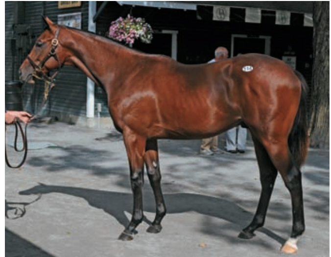
... as does this colt by Bernardini out of Easter Bunnette

with me last year, and he has about 80 with me at the moment.”